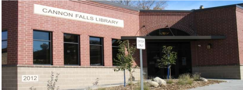
Cannon Falls – 14,539