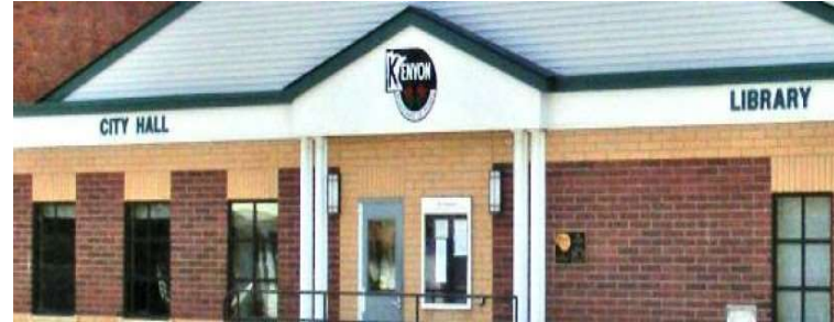
Kenyon – 6,993