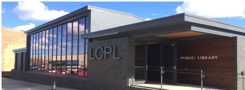
Lake City – 32,993