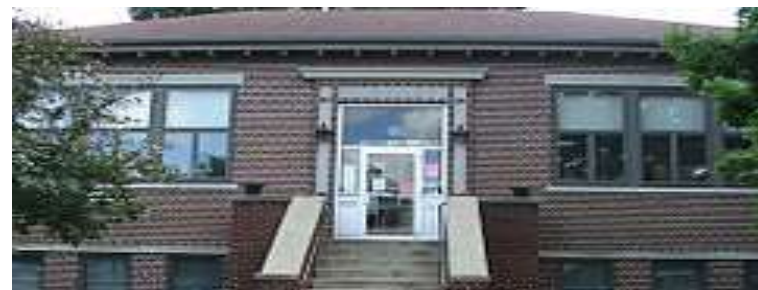
Pine Island – 4,330