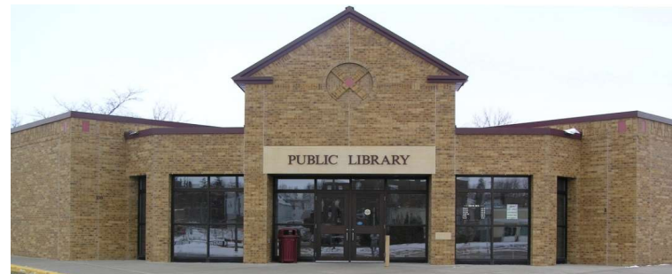
Zumbrota – 23,876