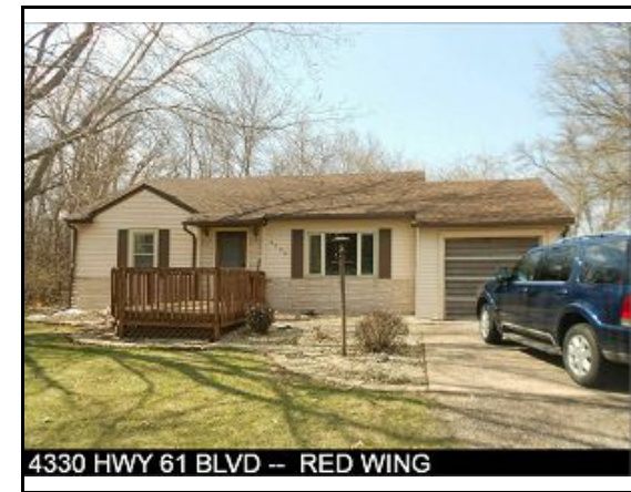
4330 HWY 61 BLVD -- RED WING