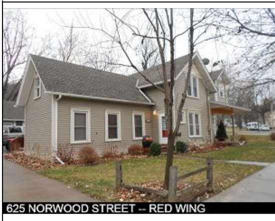
625 NORWOOD STREET -- RED WING

PIN: 55.490.0530 Route: 000-000-000 Deedholder: ALEXANDER MALECHA Address: 625 NORWOOD ST Map Area: 55 RED WING-R Subdivision: 55490 SOUTH SIDE ADD Tax District: CITY OF RW 256 Land SF: 10,440 Total Acres: 0.240