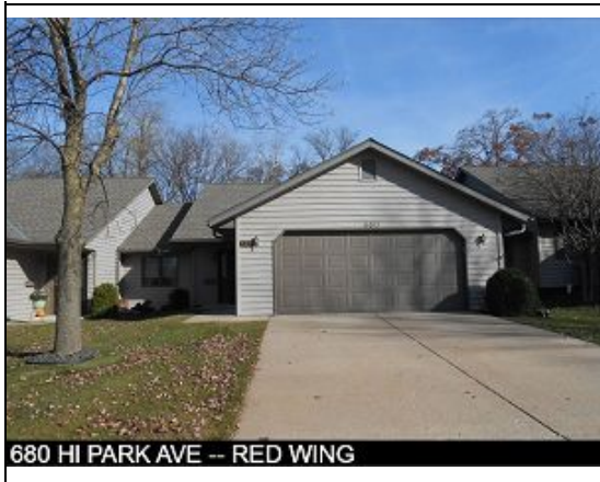
680 HI PARK AVE -- RED WING

PIN: 55.274.0020 Route: 000-000-000 Deedholder: JOYCE M ANDERSON TRUST Address: 680 HI PARK AVE Map Area: 55 RED WING-R Subdivision: 55274 HI PARK HILLS TOWNHOUSES #1 Tax District: CITY OF RW 256 Land SF: 43,560 Total Acres: 1.000