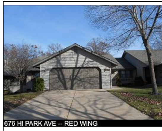
676 HI PARK AVE -- RED WING