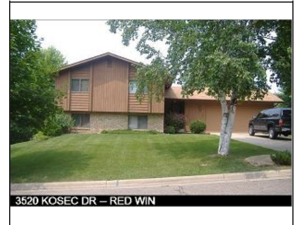
3520 KOSEC DR -- RED WING