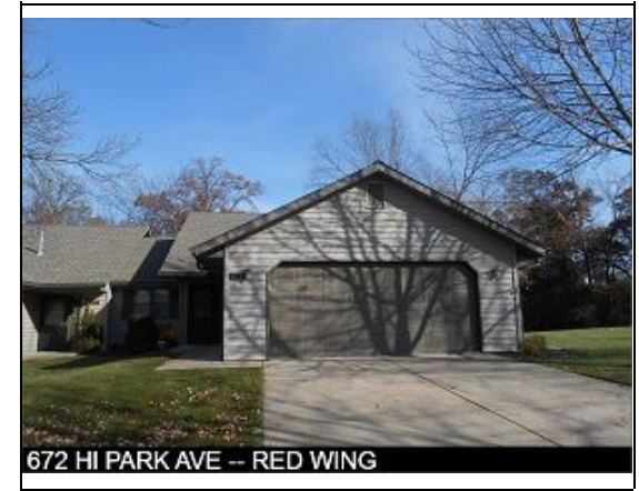
672 HI PARK AVE -- RED WING