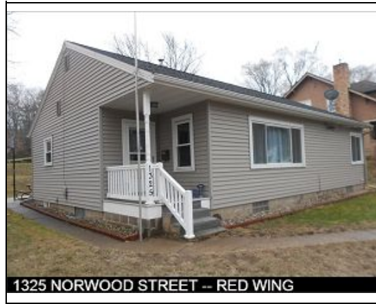
1325 NORWOOD STREET -- RED WING