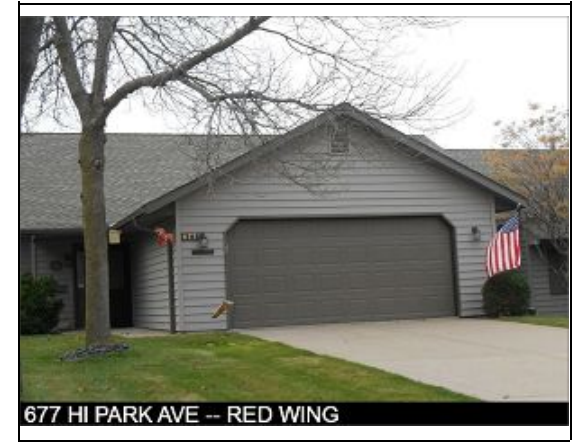
677 HI PARK AVE -- RED WING