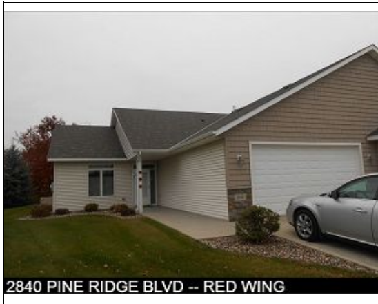
2840 PINE RIDGE BLVD -- RED WING

PIN: 55.416.0580 Route: 000-000-000 Deedholder: GLORIA H GUSTAFSON Address: 2840 PINE RIDGE BLVD Map Area: 55 RED WING-R Subdivision: 55416 PINE RIDGE 2ND ADD Tax District: CITY OF RW 256 Land SF: 43,560 Total Acres: 1.000