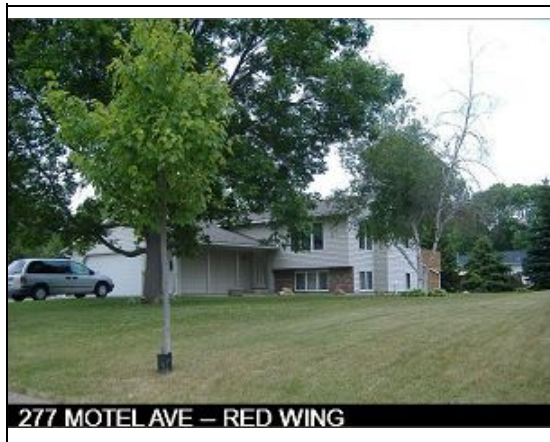
277 MOTEL AVE – RED WING

PIN: 55.727.0480 Route: 000-000-000 Deedholder: JOSEPH BRILES Address: 277 MOTEL AVE Map Area: 55 RED WING-R Subdivision: 55727 SECTION 27 Tax District: CITY OF RW 256 Land SF: 14,400 Total Acres: 0.331