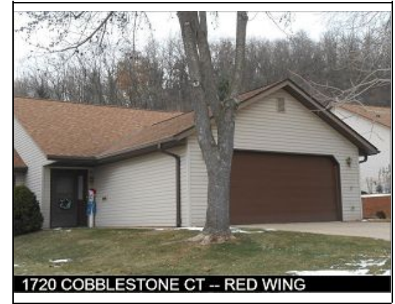
1720 COBBLESTONE CT -- RED WING