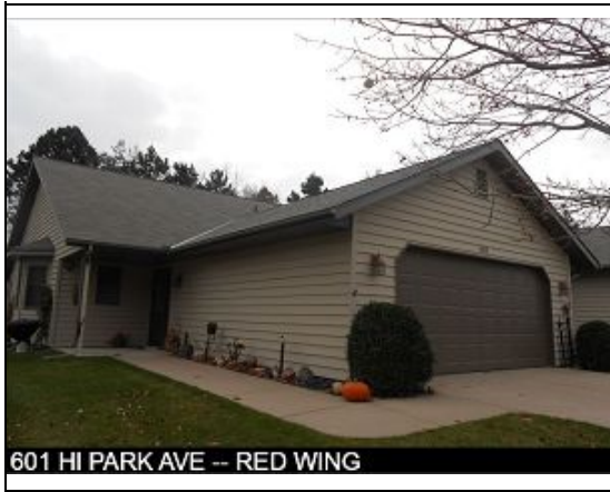
601 HI PARK AVE -- RED WING

PIN: 55.251.0300 Route: 000-000-000 Deedholder: RUTH J CARLSON Address: 601 HI PARK AVE Map Area: 55 RED WING-R Subdivision: 55251 HI PARK HILLS TOWNHOUSES #2 Tax District: CITY OF RW 256 Land SF: 43,560 Total Acres: 1.000