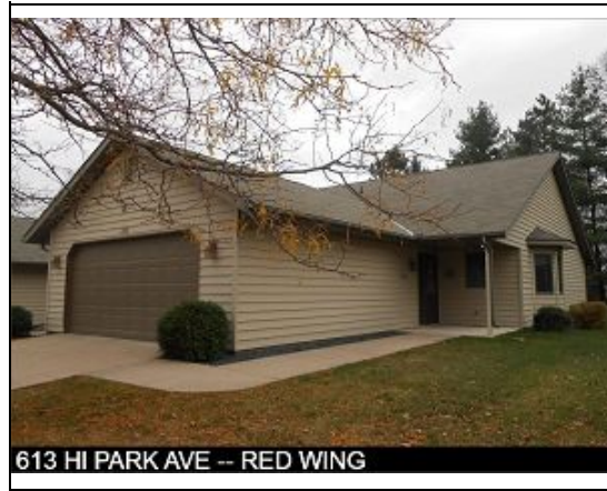
613 HI PARK AVE -- RED WING