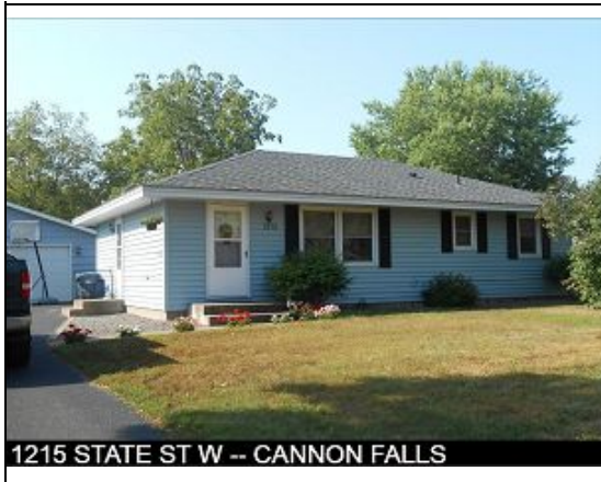
1215 STATE ST W -- CANNON FALLS

PIN: 52.120.0610 Route: 000-000-000 Deedholder: CHRISTOPHER MIKEL Address: 1215 STATE ST W Map Area: 52 CANNON FALLS-R Subdivision: 52120 CANNON FALLS CENTRAL ADD Tax District: CF CITY 252-204 Land SF: 9,648 Total Acres: 0.222