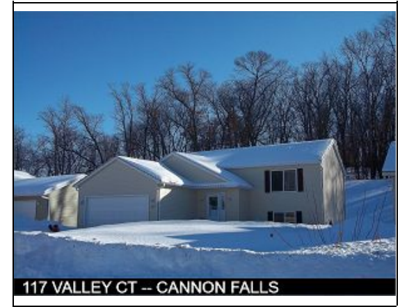
117 VALLEY CT -- CANNON FALLS