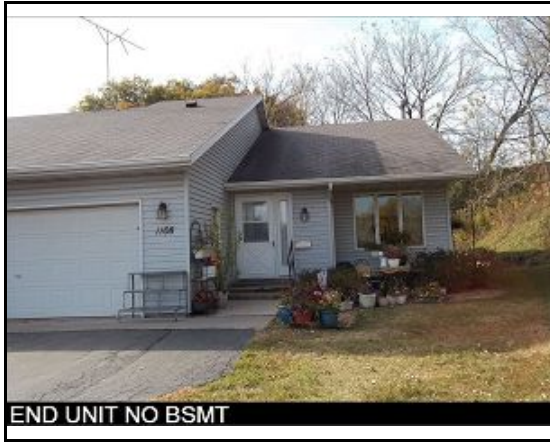
END UNIT NO BSMT

PIN: 52.410.0020 Route: 000-000-000 Deedholder: ALLEN G CHYTRACEK Address: 1112 PARK CT Map Area: 52 CANNON FALLS-R Subdivision: 52410 PARK COURT CONDO #29 Tax District: CF CITY 252-204 Land SF: 43,560 Total Acres: 1.00