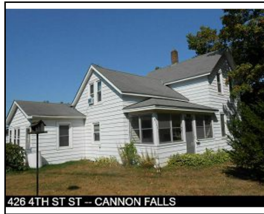
426 4TH ST ST -- CANNON FALLS