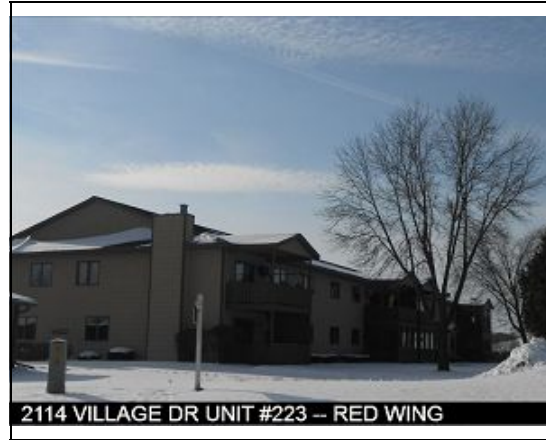
2114 VILLAGE DR UNIT #223 -- RED WING