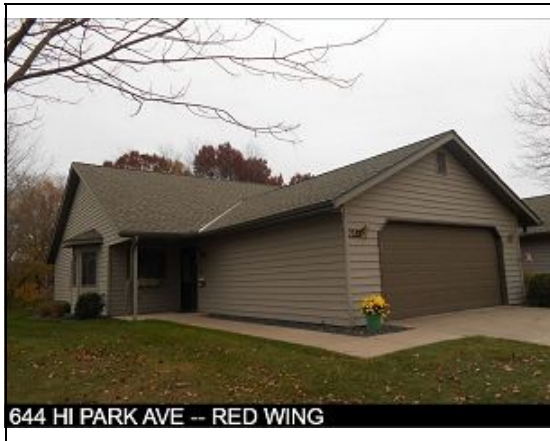
644 HI PARK AVE -- RED WING

PIN: 55.251.0050 Route: 000-000-000 Deedholder: DONALD L TIMM Address: 644 HI PARK AVE Map Area: 55 RED WING-R Subdivision: 55251 HI PARK HILLS TOWNHOUSES #2 Tax District: CITY OF RW 256 Land SF: 43,560 Total Acres: 1.000