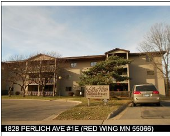
1828 PERLICH AVE #1E (RED WING MN 55066)

PIN: 55.557.0050 Route: 000-000-000 Deedholder: JH PROPERTIES LLC Address: 1828 PERLICH AVE Map Area: 55 RED WING-R Subdivision: 55557 VALLEY VIEW CONDO #10 Tax District: CITY OF RW 256 Land SF: 43,560 Total Acres: 1.000