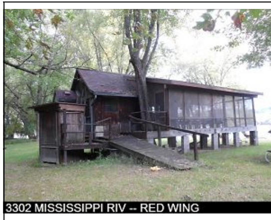
3302 MISSISSIPPI RIV -- RED WING