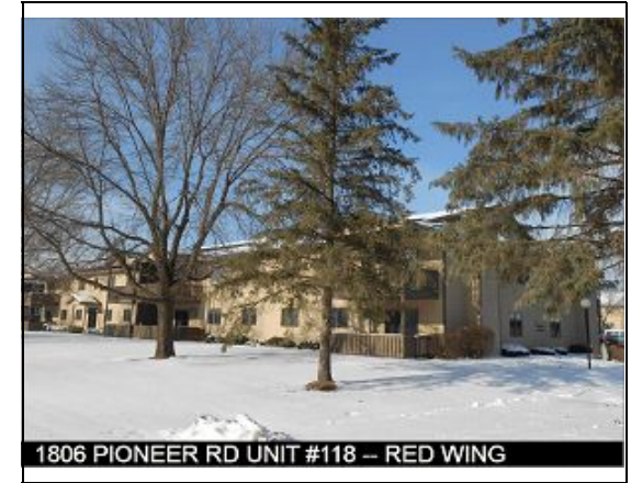
1806 PIONEER RD UNIT #118 -- RED WING

Buyer: RUTH A ALLEN Seller: DAVID A SEYMOUR