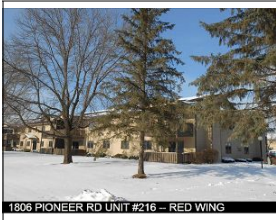
1806 PIONEER RD UNIT #216 -- RED WING

PIN: 55.426.0140 Route: 000-000-000 Deedholder: MATTHEW C DAMMANN Address: 1806 PIONEER RD Map Area: 55 RED WING-R Subdivision: 55426 PION VIL CAR HM CON Tax District: CITY OF RW 256 Land SF: 43,560 Total Acres: 1.000