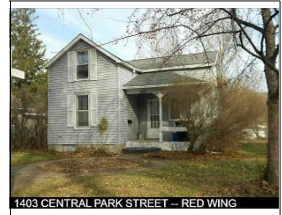
1403 CENTRAL PARK STREET -- RED WING