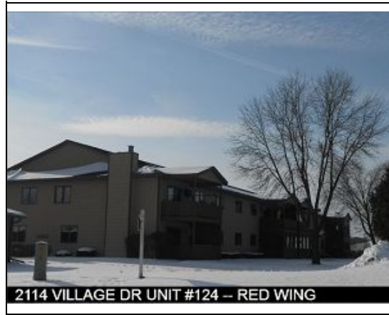
2114 VILLAGE DR UNIT #124 -- RED WING