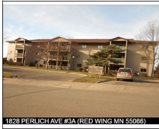
1828 PERLICH AVE #3A (RED WING MN 55066)