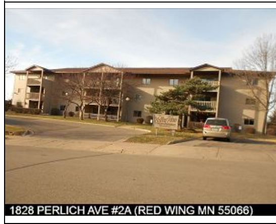
1828 PERLICH AVE #2A (RED WING MN 55066)