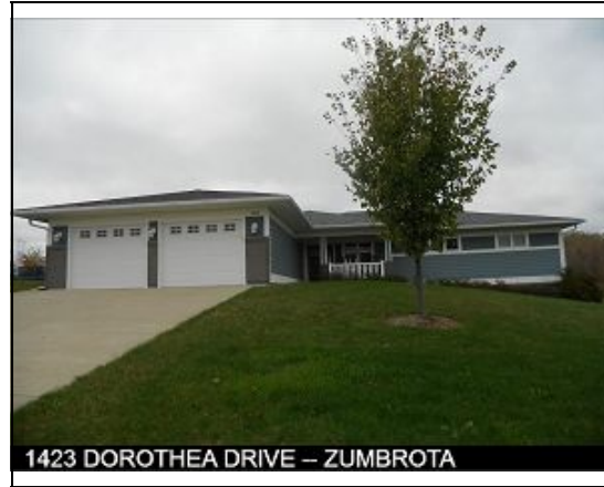
1423 DOROTHEA DRIVE – ZUMBROTA