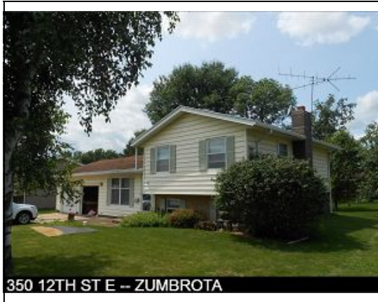
350 12TH ST E -- ZUMBROTA

PIN: 72.520.0150 Route: 000-000-000 Deedholder: MOLLY M GROVER Address: 350 12TH ST E Map Area: 72 ZUMBROTA-R Subdivision: 72520 SCHERERS FIRST ADD Tax District: ZUMBROTA CITY 2805 Land SF: 9,651 Total Acres: 0.222