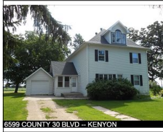
6599 COUNTY 30 BLVD -- KENYON