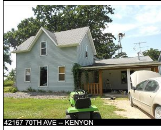
42167 70TH AVE -- KENYON